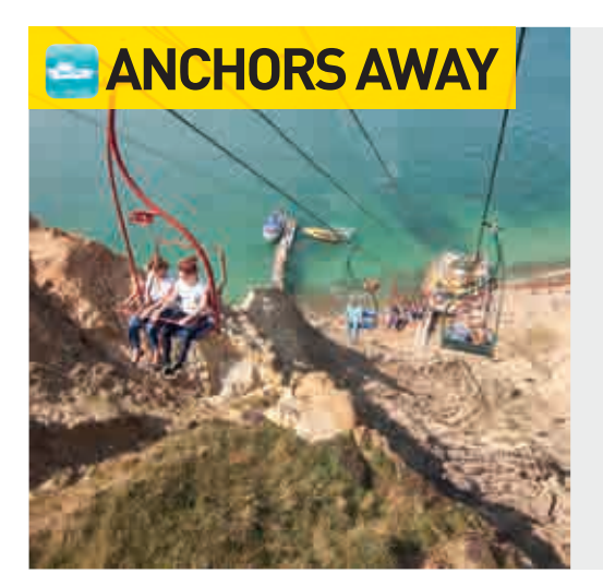
Figure 1: The Isle of Wight's Festival of Running in early June incorporates a number of races around this scenic part of the Island – see visitisleofwight.co.uk

It's an understatement to say that we like boats on the Isle of Wight. Many of us are obsessed with them and the Island is famous for events including the Round the Island Race, a one-day yacht race which regularly attracts over 1,700 boats and around 16,000 sailors, making it one of the largest yacht races in the world. Find out what the fuss is all about by taking a boat around the Needles. Head for The Needles Landmark Attraction , then walk down the path to Alum Bay (or go the fun way – by chair lift). Admire the multicoloured sands as you make your descent, and then catch a little boat out to the Needles. If this seems too tame, then head for Adventure Activities – under their supervision, you can try coasteering, where you basically jump off a cliff!